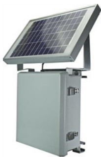
Solar Power Kit